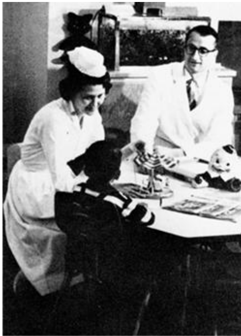
At the National Cancer Institute (NCI) in the 1960s physicians Emil Frei